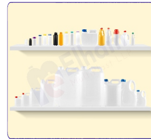
Agro Chemicals and Pesticides